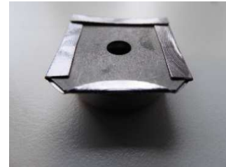
Fig. 3: Liner with perforated cover