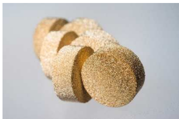
Fig. 1: Substance WR4-SF Patinal®

Place WR4-SF Patinal® tablet (see figure 1) into evaporation chamber immediately after unpacking from original package and start evacuation. For tablet handling please use tweezers.