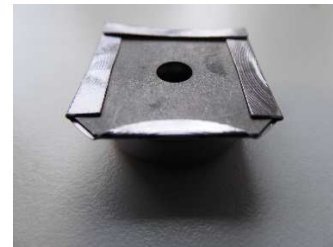
Fig. 3: Liner with perforated cover