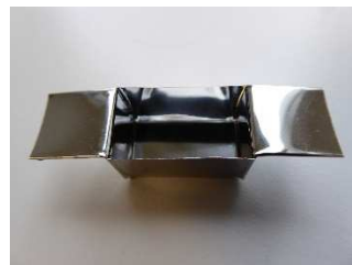
Fig. 2: Box type boat