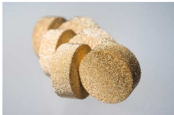
Fig. 1: Substance WR4-SF Patinal®

Place WR4-SF Patinal® tablet (see figure 1) into evaporation chamber immediately after unpacking from original package and start evacuation. For tablet handling please use tweezers.